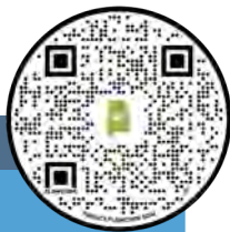
The A+ Policy Portal