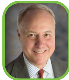
Preston Bolt Hand Arendall, LLC