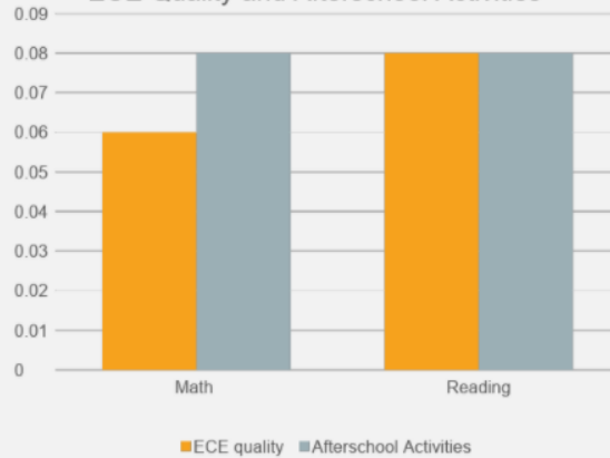
Achievement Test Scores Associated with ECE Quality and Afterschool Activities